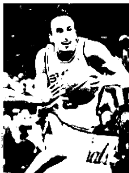
The Spurs' playmaker: Manu Ginobili

But a changing of rosters on top teams is only one of several twists basketball fans will encounter when they tune in this season. With overall viewership declining during the past few years and handwringing about players' thuggish antics, the NBA has taken a step to make the league appear more professional: Players must abide by a "business casual" dress code while engaged in league business. That means no