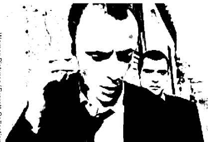
" Paradise Now " follows the fates of two young would-be suicide bombers.

In the fictional " Paradise Now ," two young Palestinian men are chosen to commit a suicide bombing in Tel Aviv. After a final night spent with their families, who know nothing of the plan, they become separated and must decide independently whether to go through with their plot. Another fictional drama, " The War Within ," released last month, portrays a well-educated terrorist who comes to New York on a suicide-bombing mission. And in December, Steven Spielberg's "Munich" will take a different approach: The film follows members of the secret Israeli squad assigned to assassinate the alleged perpetrators of the 1972 Munich Olympics massacre.