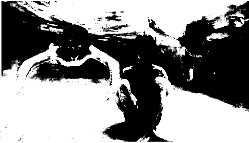
Nirvana fans get a new best-of record culled from last year's boxed set, with extra goodies including a studio outtake and a rehearsal version of "Come as You Are."